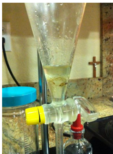
(Lavender oil from extraction)

When the extraction is over, you will have a hydrosol and an essential oil mixture. Pour this mixture into it the separating funnel and allow it to settle over the course of about 10 minutes. Next, slowly drain the water from the separatory funnel until only the oil is left. The oil may now be drained into a separate vessel. The other water solution that was initially drained off is your hydrosol mixture and will retain the fragrance of the plants oil. This mixture may be used for many similar application as the oil, so be sure not to discard it.